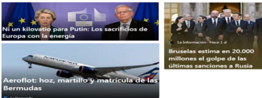
Figure 11. Balance of the war V.

Anyway, I'm telling you that all the sanctions that have been taken from the European Union actually look, what the airlines have done has been to register in Bermuda and that's it, on the other hand, what they do is that all the gas and the oil is bought by India and then resold to us. For its part, Russia cannot take it and start selling to other parts of the world either, because in reality it has gas pipelines stretched out to Europe, so until it is built and it can really pass to China and India, etc., it will be a long time. Therefore, in a certain way we are all trapped.