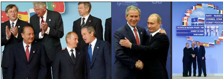
Figure 16. Images and data that kill the story I