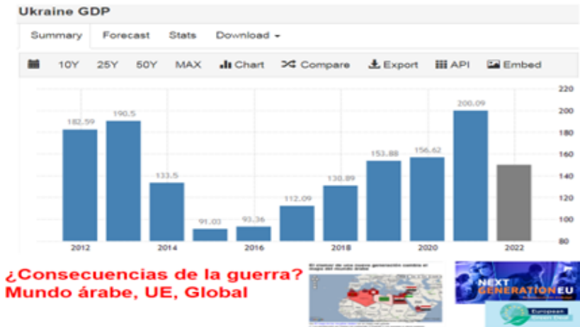
Figure 9. Balance of the war III.