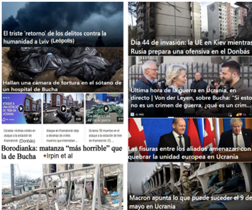
Figure 14. Results of the war III.