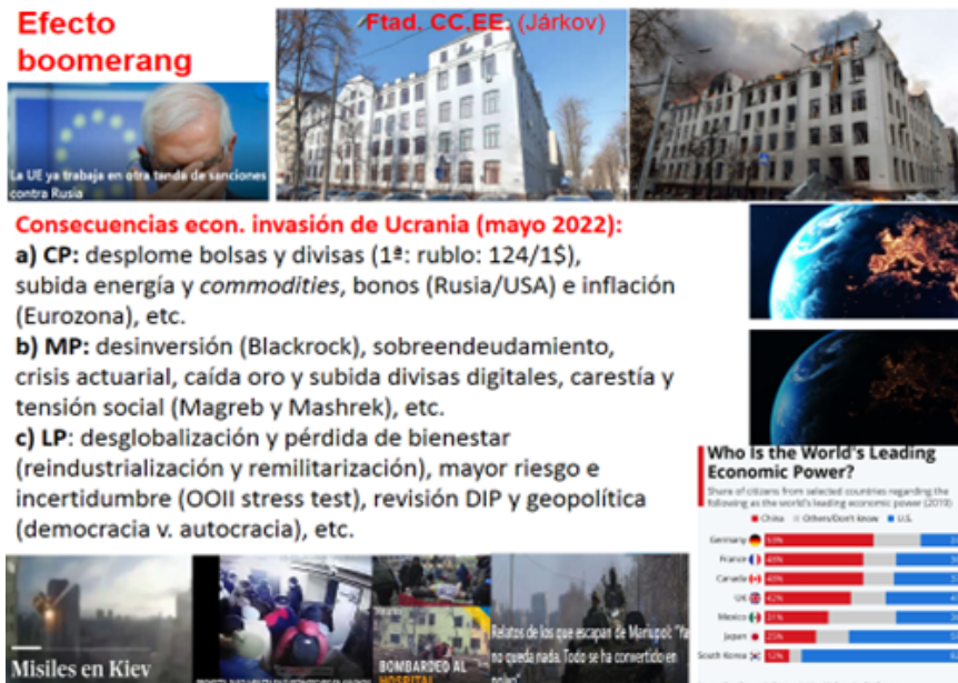
Figure 10. Balance of the war IV.