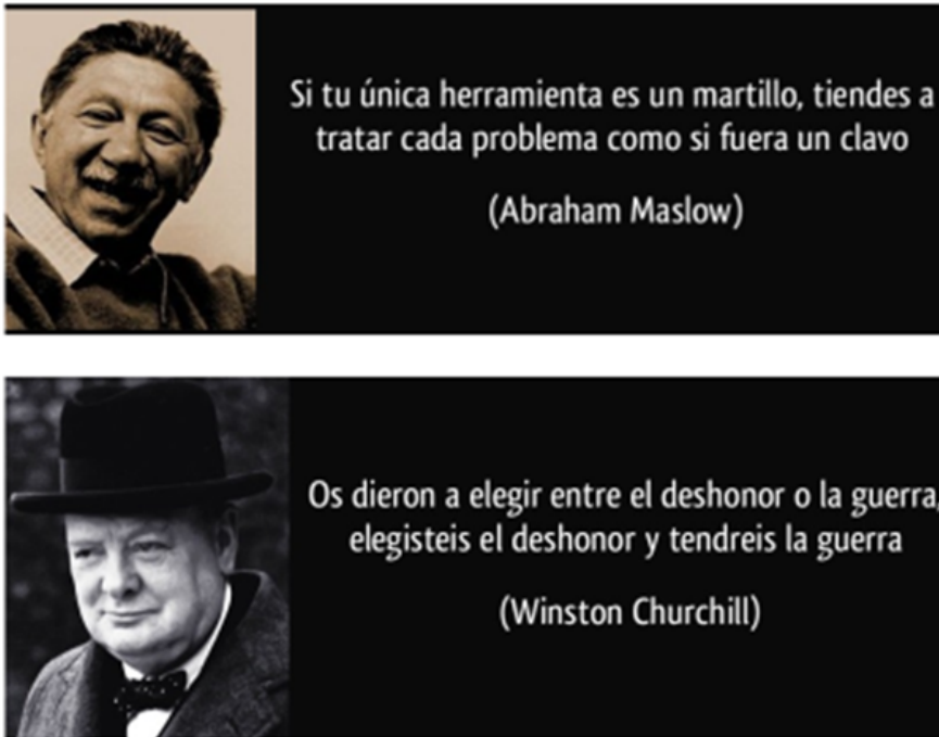
Figure 2. Preliminary reflections.