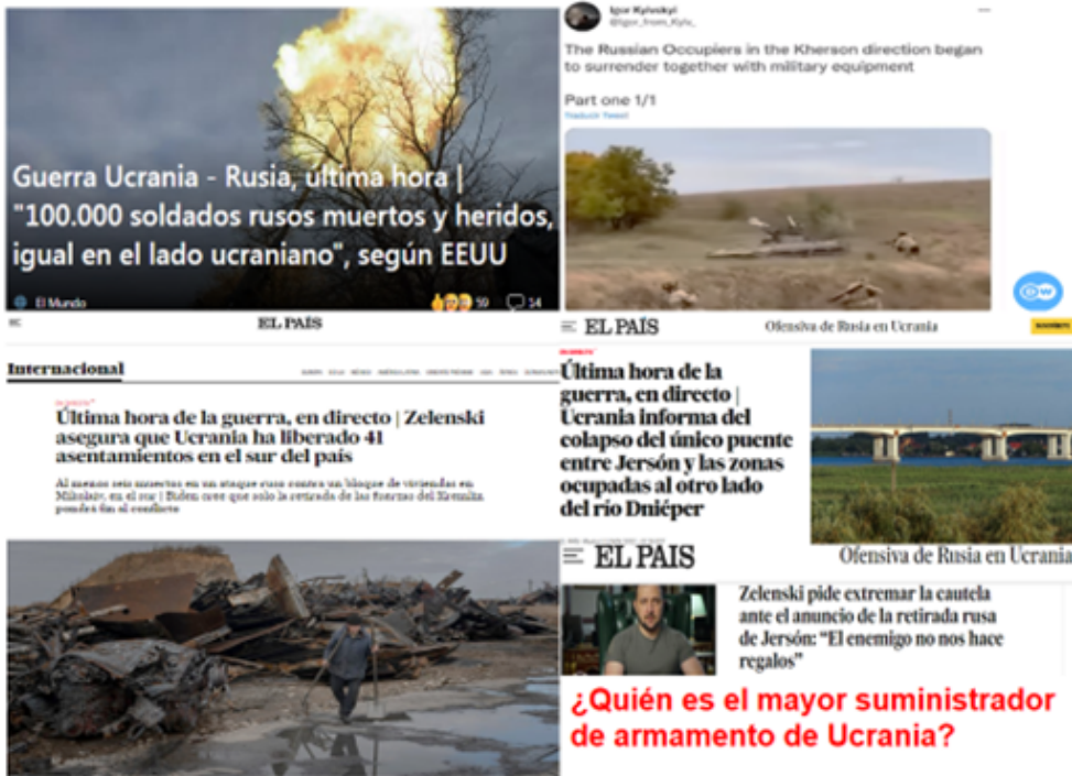
Figure 7. Balance of the war I.