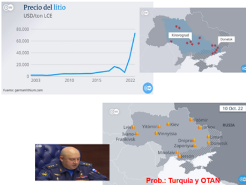
Figure 4. Lithium deposits.

Finally, we are going to see geopolitical issues in the blocks, which is not only a matter of economic interests, but also moral and cultural superiority, what is at stake is what model we are going to have because there is also a change in the Order World, and therefore hard democracy or whatever we want to call them. Quickly here you have (vid. slide).