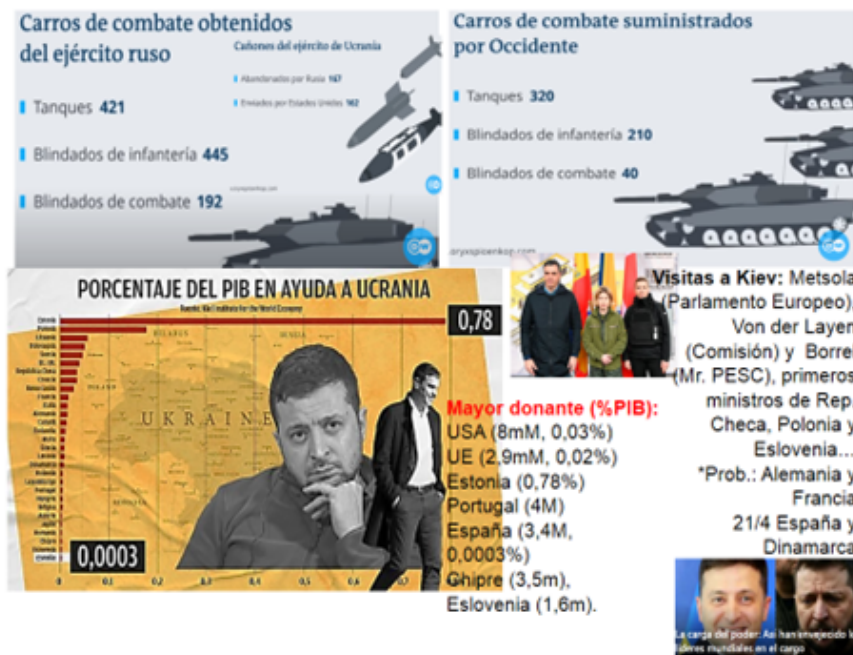
Figure 8. Balance of the war II.

But hey, do you know who has been the largest supplier of arms to Ukraine in this war? Well, believe it or not, it was Russia.