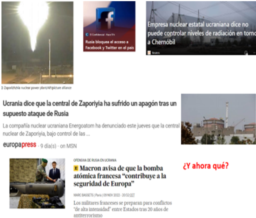
Figure 15. Results of the war IV.